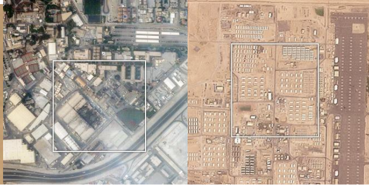
U.S. Navy 5th Fleet HQ, Bahrain; March 1