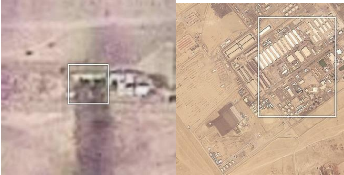
Camp Arifjan, Kuwait; March 4