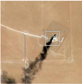
Prince Sultan, Saudi Arabia; March 1