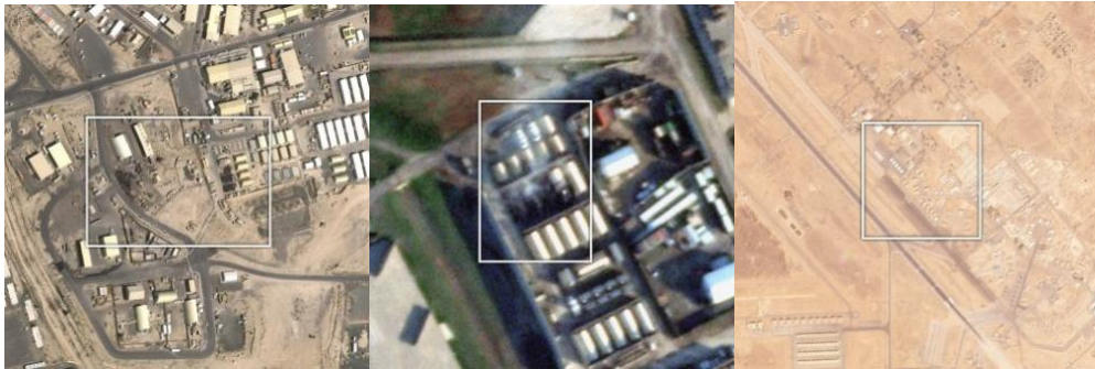
Erbil Airport, Iraq; March 1