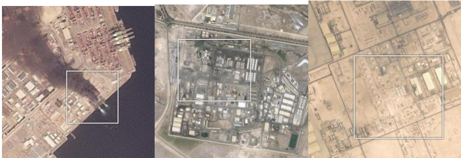
Al Dhafra, U.A.E.; March 3