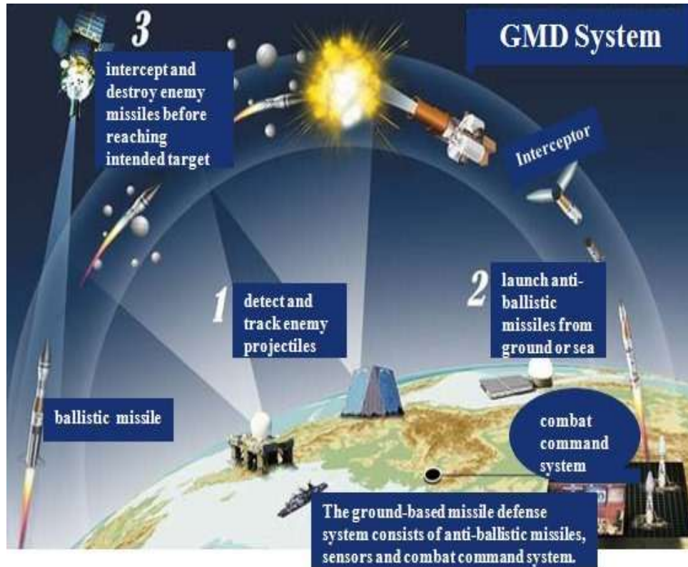
Figure 3. GMD System

performance evaluation, improvement development, and tactical modifications is essential (GAO, 2024e).