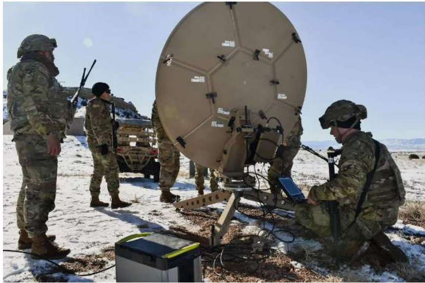
Figure 5. Expeditionary Space Control System

The Army Space Vision (2024) articulates the critical need to counter adversary space systems. However, the acquisition of the very tools these SCCs use has often proceeded without a commensurate emphasis on delivering accompanying validated M&S. This disconnect means that Soldiers are receiving advanced hardware and software without the synthetic environments required to understand their capabilities, limitations, and optimal employment against realistic threats. Consequently, the readiness and effectiveness of these units are potentially hampered by a lack of integrated M&S. GAO reports on space acquisitions have highlighted challenges in ensuring the timely delivery of critical capabilities and the need for improved planning and oversight (GAO, 2017). The absence of integrated M&S in the fielding of Army SC systems directly contributes to these challenges by delaying effective utilization and assessment.