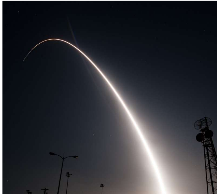
Figure 2. Ground-Based Interceptor Launch