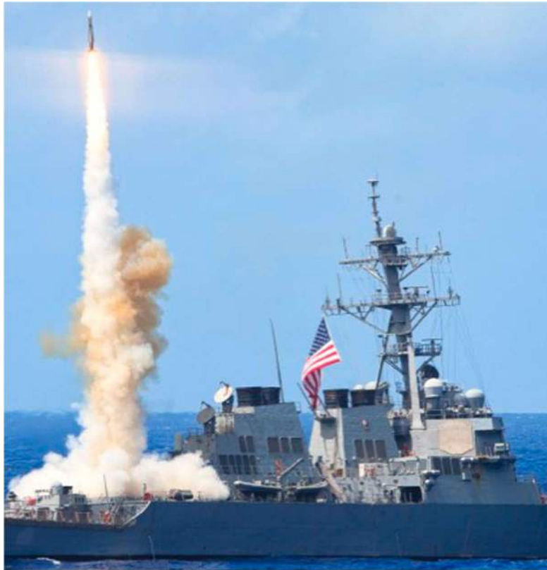
Figure 4. Aegis Combat System

in the Red Sea, where U.S. Navy destroyers equipped with ACS have engaged Houthi rebel missiles and drones of various types, underscore the imperative for continuous refinement of M&S capabilities to maintain tactical advantage and ensure the survivability of U.S. naval assets, allies, and partners, as well as merchant shipping.