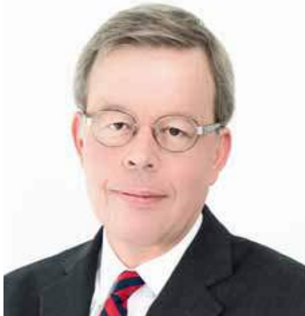
By Sen. James Talent

I cannot remember a time when an incoming administration faced so many substantial threats to American national security. In 2014, former Secretary of State Madeleine Albright said: “To put it mildly, the world is a mess.” She was right, and the world has gotten a lot worse since then.