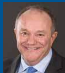
Gen. Philip Breedlove