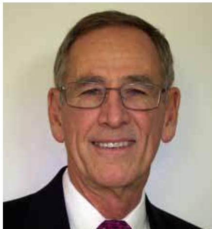
By Maj. Gen. Bruce Lawlor

W ar is politics by other means, Clausewitz said. Its violence and death are reserved for times when traditional political and diplomatic means have failed to protect the nation.