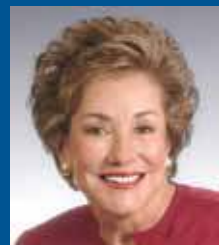
Sen. Elizabeth Dole