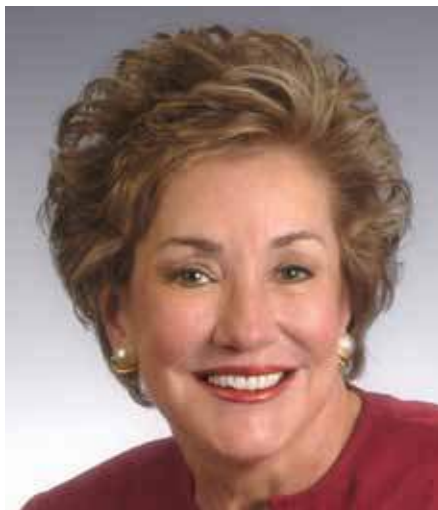
By Sen. Elizabeth Dole

D uring a recent news conference, President Trump reaffirmed his administration's commitment to helping our nation's veterans, many of whom face steep mental and physical challenges after returning from their time on the battlefield. As the longest war in U.S. history continues, so too does the responsibility to care for these brave men and women who have sacrificed so much for our freedom.