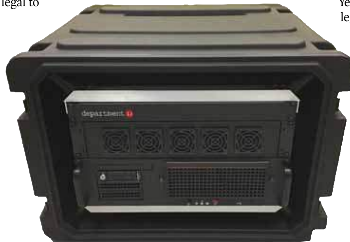
MESMER is a unique, patented, low-power, non-jamming, non-line of sight, non-kinetic drone mitigation solution, enabling an effective and safe method of protecting personnel and infrastructure from dangerous drones.

The Obama administration, working with stakeholders such as the Federal Aviation Administration, made important strides to clarifying laws. Now, the Trump administration needs to work closely with Congress to create or modify laws to allow for effective countermeasures against drones that represent a threat to public safety.