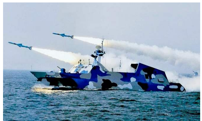
Chinese missile ship firing cruise missiles