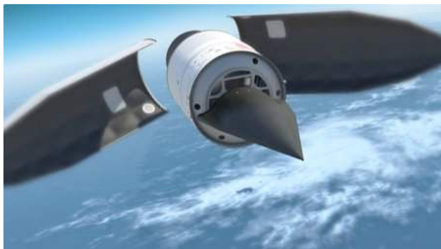
Hypersonic Glide Vehicle

Historically, China has maintained a nuclear doctrine based on the concept of ‘no-first-use’ (NFU), viewing its nuclear arsenal as a means of self-defense and deterrence. China’s military modernization program and upgrades to its nuclear weapons arsenal, along with its 2013 defense white paper that did not comment on China’s NFU pledge, has led some to question China’s commitment to its NFU policy. However, in its May 2015 defense white paper, Beijing reaffirmed its NFU policy stating that its nuclear weapons are for “strategic deterrence and nuclear counterattack.”