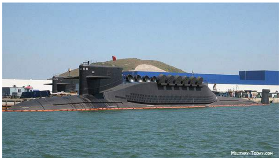
A Chinese Jin-class submarine with the SLBM launch tubes open

China currently has four Type 094/ Jin-class ballistic missiles submarines that carry up to 12 JL-2 SLBMs. The Jin-class submarine is seen as a China's first chance at a credible sea-based nuclear deterrent. The JL-2 SLBM is an intercontinental-range, three-stage ballistic missile that is similar to China's DF-31 ICBM. The JL-2 has a range of more than 7,200 km and is equipped with either a single MT nuclear warhead or three to eight smaller MIRV'd warheads. The JL-2 uses both inertial guidance and GPS systems and may also carry penetration aids and decoys.