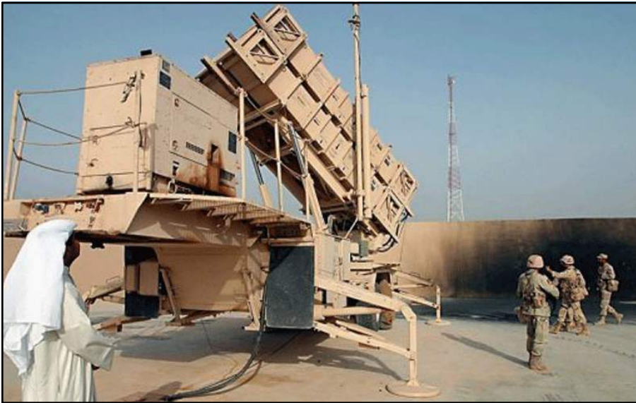
Kuwaiti Patriot BMD Launcher

The Gulf Cooperation Council (GCC), a loose economic and military confederation of the six Arab nations along the Arabian Gulf, have capacity, resources, support, and motivation to establish a robust missile defense for the region. To maximize the effectiveness of these systems, the nations of the GCC should look to better integrate them, particularly in the area of missile defense sensors and information sharing. As the GCC would likely face the brunt of Iran's ballistic missile arsenal should conflict occur, missile defense capability is of the highest priority for regional security and stability.