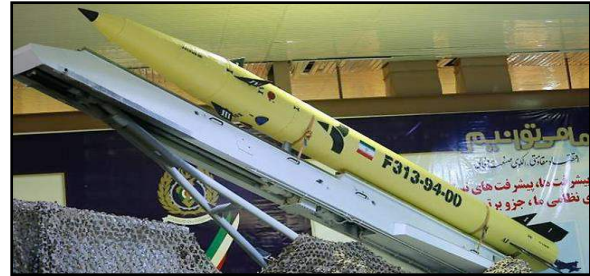
Fateh 313 SRBM

Iran possesses a large inventory of short-range missiles capable of threatening GCC member states. The short-range variants of the Shahab family of missiles are based on the Scud missile design and their road-mobile launchers allow quick dispersal making them a difficult target for preemptive strikes. Iran also indigenously designed the Fateh class of missiles, including the Fateh-313, which it unveiled in August 2015.