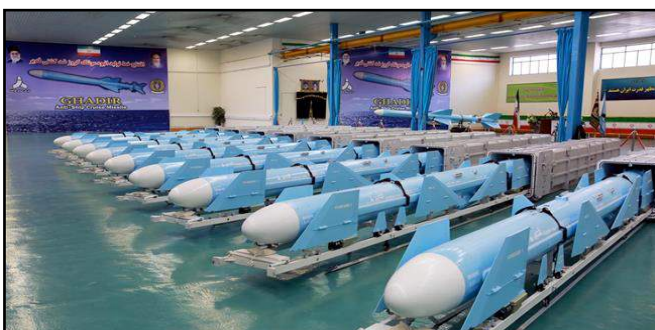
Qadir Anti Ship Cruise Missiles (300 km ranged)