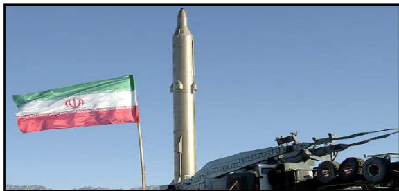
Sejjil 2 MRBM