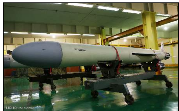
Soumar Cruise Missile

Reports suggest that in 2001, Iran imported 12 Kh-55 land attack cruise missiles from Ukraine. In the Soviet arsenal, these missiles were nuclear armed and launched from aircraft, but lacking a heavy bomber capacity, the Islamic Republic has attempted to adapt these missiles to a ground-based platform. In March 2015, Iran unveiled an indigenous long-range cruise missile called the Soumar, which has many similar characteristics to the Kh-55. This missile has a reported range of up to 2500 km. Such range gives Soumar the potential to circumvent GCC BMD sensors by flying over the Gulf of Aden and northward over Oman.