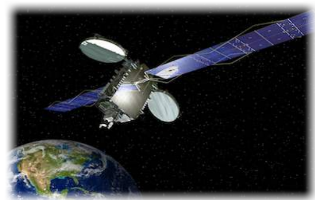
CHIRP Satellite (conceptual)

In addition to controlling costs, another important issue is making U.S. defense satellites less vulnerable to the growing threat of anti-satellite (ASAT) weapons. Reducing costs will aid in this, as it would allow for larger satellite constellations that are more resilient to ASAT attacks.