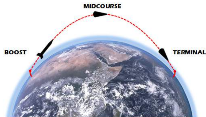
PHASES OF BALLISTIC MISSILE FLIGHT Image by Nuclear Threat Initiative

The long loiter times of UAVs make them the ideal systems to deploy advanced sensor capabilities and to potentially deploy future directed energy (laser) based systems for boost phase missile defense. Further development of solid-state lasers may be required to make such a system viable, as the ALTB had to be housed in a 747 due to the weight associated with its chemical laser. Sea-based interceptors could also be used in boost phase intercepts as long as the associated ships were deployed sufficiently close to adversary missile sites. The SM-3 Block IIA, co-developed with Japan and tested in June 2015, could also be outfitted for boost phase defense with investment in a lighter kill vehicle that would allow the system to reach the intercept speeds necessary to hit an accelerating missile.