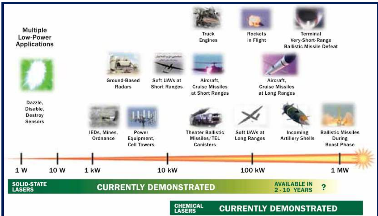
Graphic by the Center for Strategic and Budgetary Assessments

The Navy has worked on developing free electron lasers (FEL), which use beams of electrons accelerated to nearly the speed of light in rings and powerful magnets to then “wiggle” the electron beams into a focused beam of laser photons. These beams can be tuned to different wavelengths to adjust to different atmospheres, making them adaptable in the maritime environment. The Navy hopes to produce a multi-megawatt FEL in the 2020’s. To accomplish that and turn an FEL into a deployable system, work will need to be done to increase the efficiency of its energy use, regulation of thermal loads and shielding of systems of personnel.