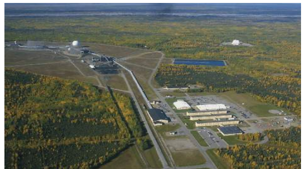
Clear Air Force Station, Alaska, chosen site of LRDR

Long Range Discriminating Radar (LRDR) - The LRDR will be a large S-Band radar deployed in central Alaska. The S-Band radar will provide persistent tracking and discrimination data of ballistic missiles heading towards the United States from the Asia-Pacific region. Its long range will fill in many of the gaps that currently exist in U.S. situational awareness over the Pacific Ocean.