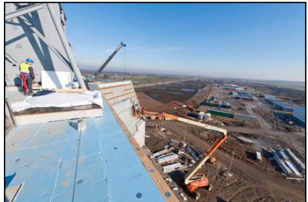
Aegis Ashore Construction Site, Deveselu, Romania