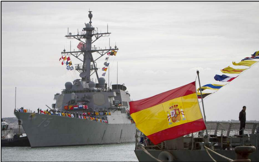
U.S. Aegis BMD Ship USS Donald Cook (DDG-75) arrives in Rota,

Since 2009, U.S. deployments of missile defense in Europe have been guided by the European Phased Adaptive Approach (EPAA), which calls for the phased deployments of regional missile defense systems to counter ballistic missile threats to Europe from the Middle East. As Phase 2 of this program nears completion, Europe's strategic environment has shifted since EPAA's inception, and NATO faces a critical decision point on whether its BMD policies and capabilities should be adapted to address these changes.