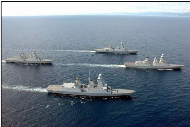
Above: Danish Iver Huitfeldt-class Frigates (potential candidates for BMD radar upgrades)

Progress continues in the use of missile defense capabilities to protect NATO members against missile threats from the Middle East. In December 2012, Germany, the United States, and the Netherlands deployed Patriot systems to Turkey to protect a NATO ally from missiles launched from Syria. The United States has moved forward in implementing the EPAA by breaking ground on the Aegis Ashore site in Romania in October 2013 and deploying the USS Ross and USS Donald Cook Aegis Destroyers to Rota in 2014. In August 2014, Denmark announced the decision to support NATO BMD with a frigate-based radar system, which a Russian Ambassador later threatened with nuclear strikes. In May 2015, Romania announced that the first interceptors for the Aegis Ashore site in Deveselu would be deployed by the end of the year, and the USS Porter became the third Aegis ship to deploy to Rota. Poland also announced in early 2015 a major purchase of as many as seven Patriot missile defense batteries.