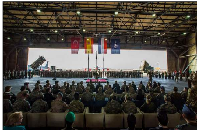
Above Right: NATO Patriot missile defense mission to Turkey deployment ceremony.