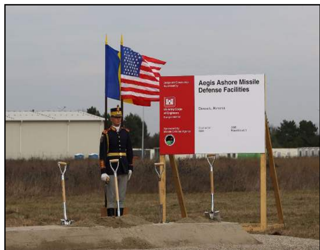
Right: Ground-breaking ceremony, Aegis Ashore site at Deveselu, Romania