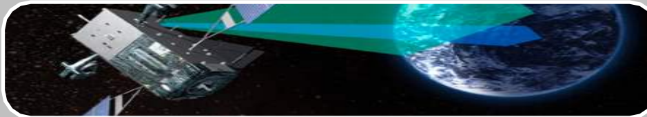
Space Based Infrared System (SBIRS)

The ability to track and discriminate is determined by the sophistication and completeness of radar coverage and the sophistication of the seeker onboard the Kill Vehicle.