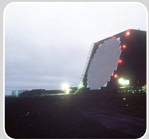
Cobra Dane Early Warning Radar Shemya, Alaska