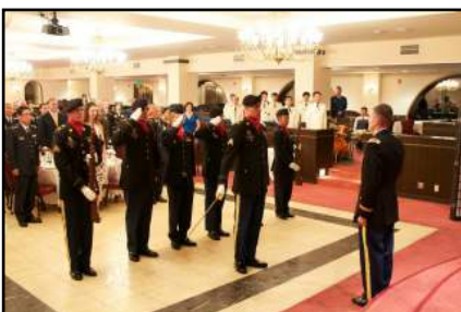
MDAA's 2013 Okinawa Missile Defender of the Year Awards