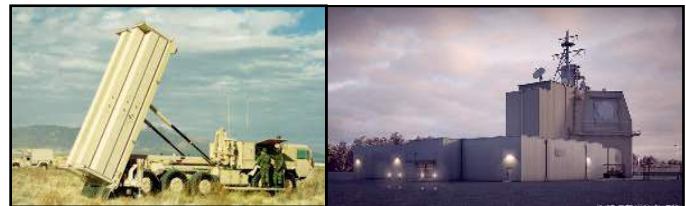
Left: Terminal High Altitude Area Defense (THAAD) Firing Unit Right: Aegis Ashore Installation

Japan is considering the JLENS aerostat surveillance and sensor capability for both tracking and fire control in its quest to defend its air space and island territory that is being constantly challenged by China and Russia.