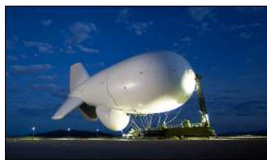
Joint Land Attack Area Netted Sensor (JLENS)