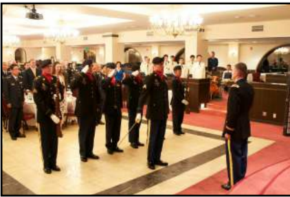
MDAA's 2013 Okinawa Missile Defender of the Year Awards