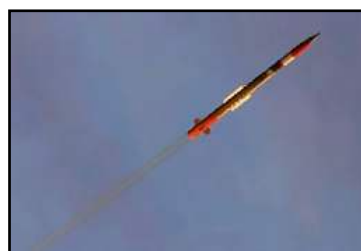
Patriot Missile Segment Enhancement (MSE) Interceptor