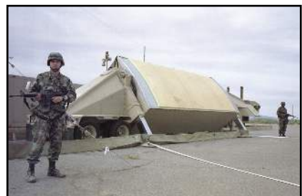
Right: U.S. TPY-2 Radar Deployed in Kyogamisaki, Japan