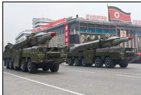
North Korean No-Dong 1 Medium Ranged Ballistic Missiles (1250 km range)

Japan also faces a secondary threat from Russia. Japan and Russia have a long-standing dispute over the Kuril island chain north of Hokkaido. Russian planes have also increasingly intruded on Japanese airspace in recent years. The Japanese Air Force has been forced to scramble fighter jets over 1000 times to intercept Russian aircraft since 2013, an issue exacerbated by Japan's realignment of its military forces to its southern islands in response to China. In addition to its large ground-launched ballistic and cruise missile arsenal, Russia has 14 submarines in its Pacific fleet armed with cruise and ballistic missiles, most of which are nuclear tipped.