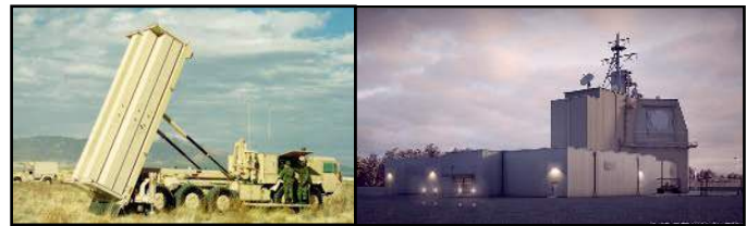
Left: Terminal High Altitude Area Defense (THAAD) Firing Unit Right: Aegis Ashore Installation

Japan is considering the JLENS aerostat surveillance and sensor capability for both tracking and fire control in its quest to defend its air space and island territory that is being constantly challenged by China and Russia.