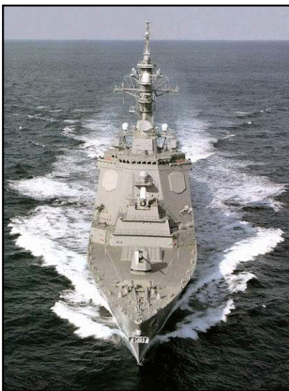
Japan's Atago Class Cruiser